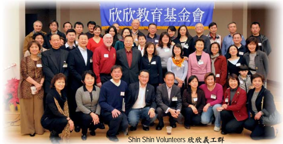
Shin Shin Volunteers 欣欣義工群

北京代表處尚處在發展初期，也被大家寄予厚望，接下來，代表處將開始建立並保持與主管單位、合作方、教育機構、專家、學校和僑辦的聯絡溝通。對於基金會的專項工作，如ECTT、圖書計劃、eLearning等，提供支持服務。在中國積極招募更多志同道合的義工壯大我們的隊伍。並發揚欣欣回饋社會的服務精神。希望能夠讓欣欣教育基金會在中國的教育慈善事業上取得更大成功。我們本著腳踏實地的發展理念，堅定不移的實現欣欣人的長遠目標。